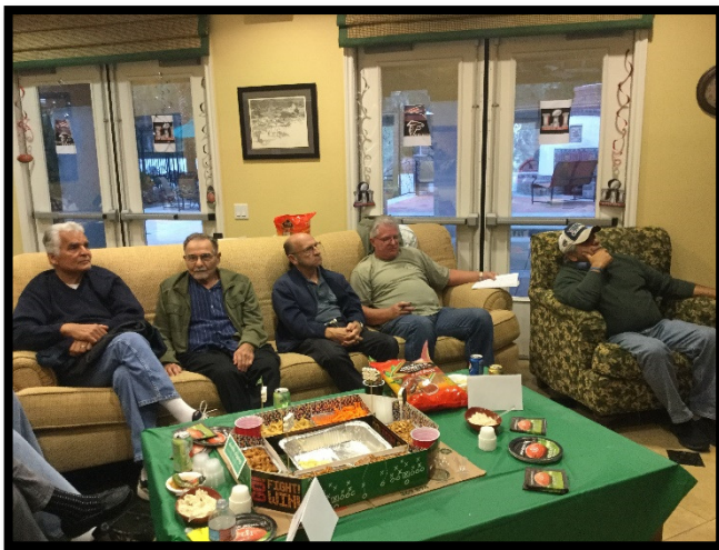
Super Bowl Sunday