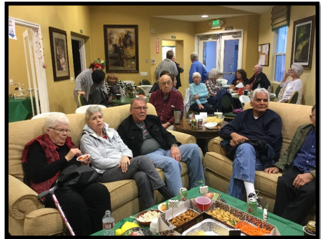
Super Bowl Sunday

CPR CLASS March 20 th 1:00 – 4:00 pm Clubhouse $15.00 – Space Limited Contact: Darlena Stevens (951) 337-1579