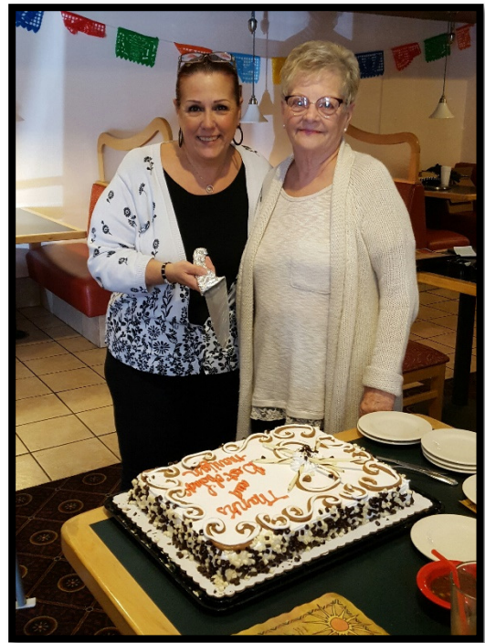
February Ladies Luncheon